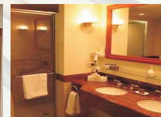
All the above pictures are of actual sample flat.